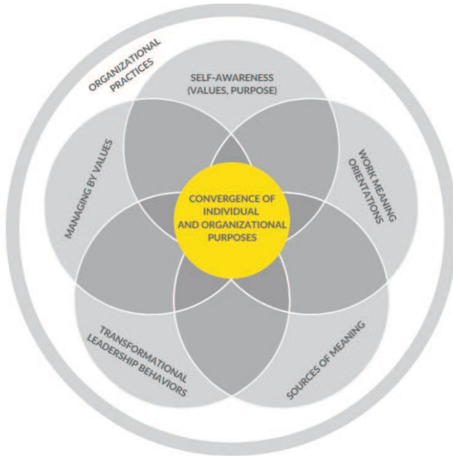
FIGURE 4: ELEMENTS' INTEGRATION