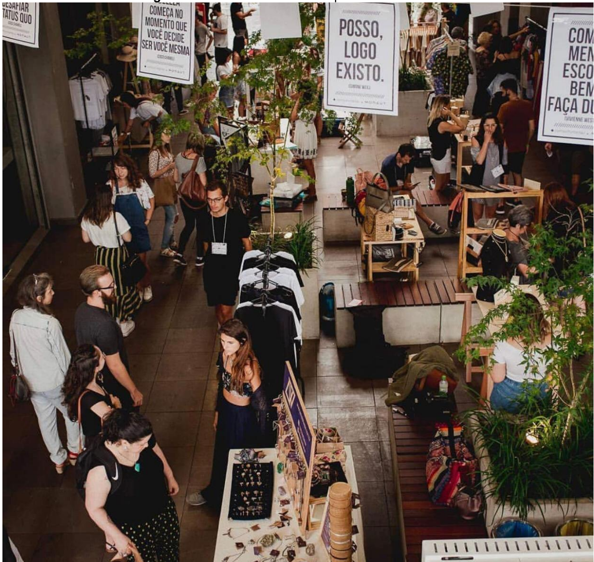
Figure 12: Consumers in an independent fashion fair.