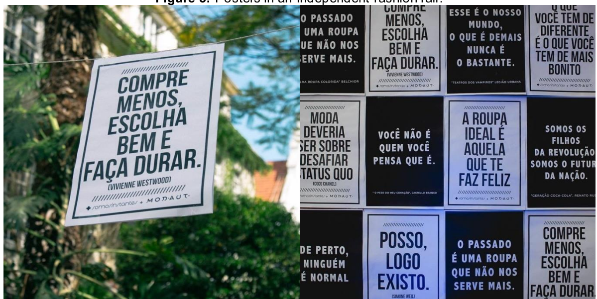
Figure 3: Posters in an independent fashion fair.

The repercussion of the Fashion Revolution movement was also observed in independent fashion fairs, such as Modaut - the first independent fair focused exclusively on sustainable fashion in Porto Alegre -, as illustrated in Figure 2. Several posters were displayed at the event, seeking to stimulate consumers on practicing a more conscious fashion consumption. "Buy less, choose well and make it last" and "Fashion should be about defying the status quo", "The past is a garment that no longer fits us", and "I can, therefore I exist", says the posters in Figure 3.