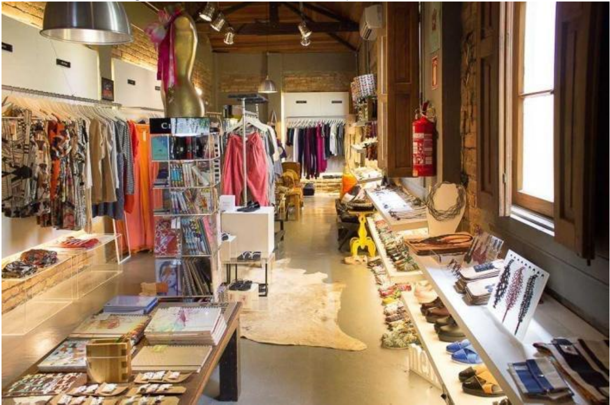
Figure 11: Collaborative store of independent fashion brands.