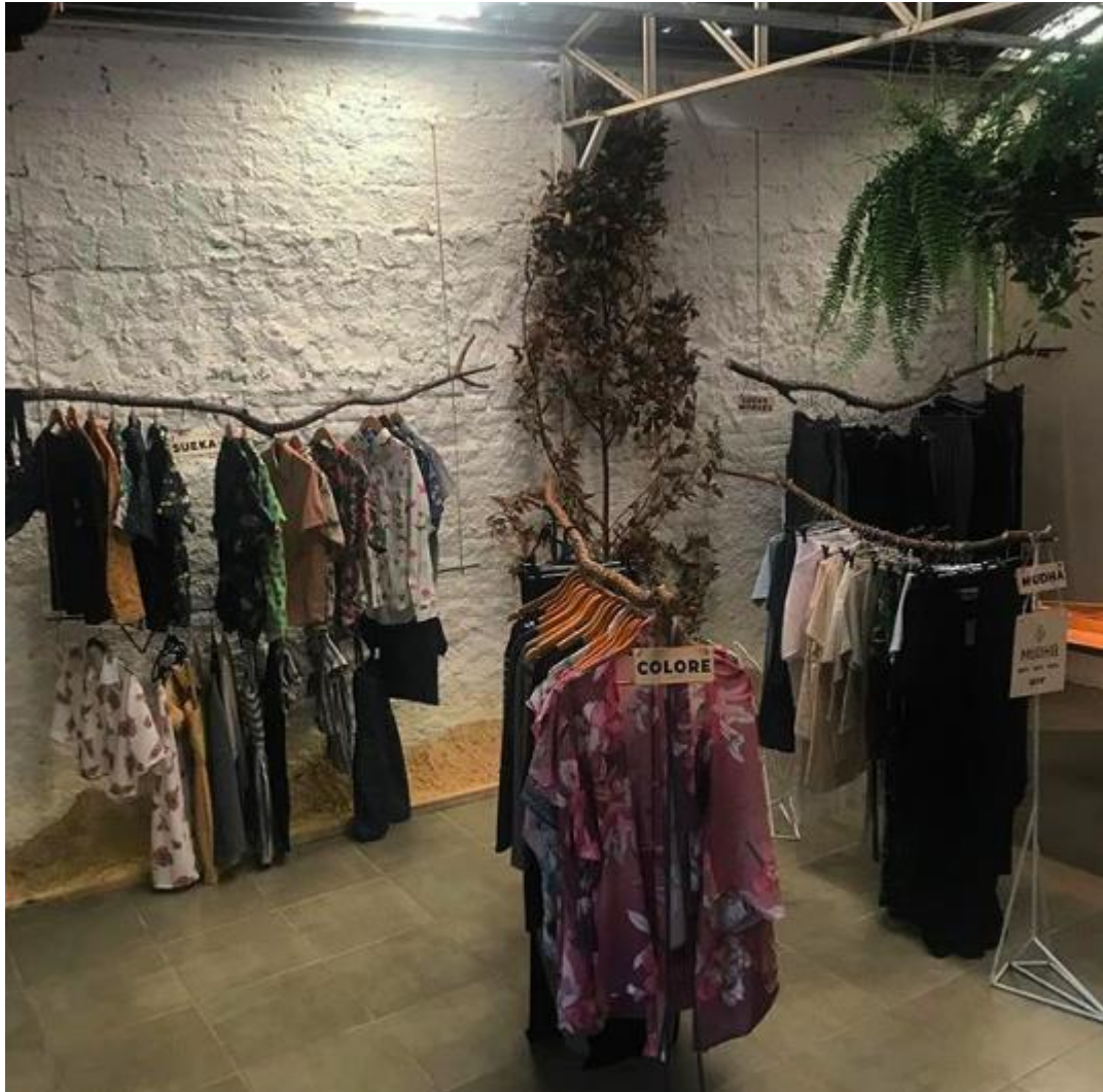
Figure 13: Collaborative store from an independent fashion brands collective.