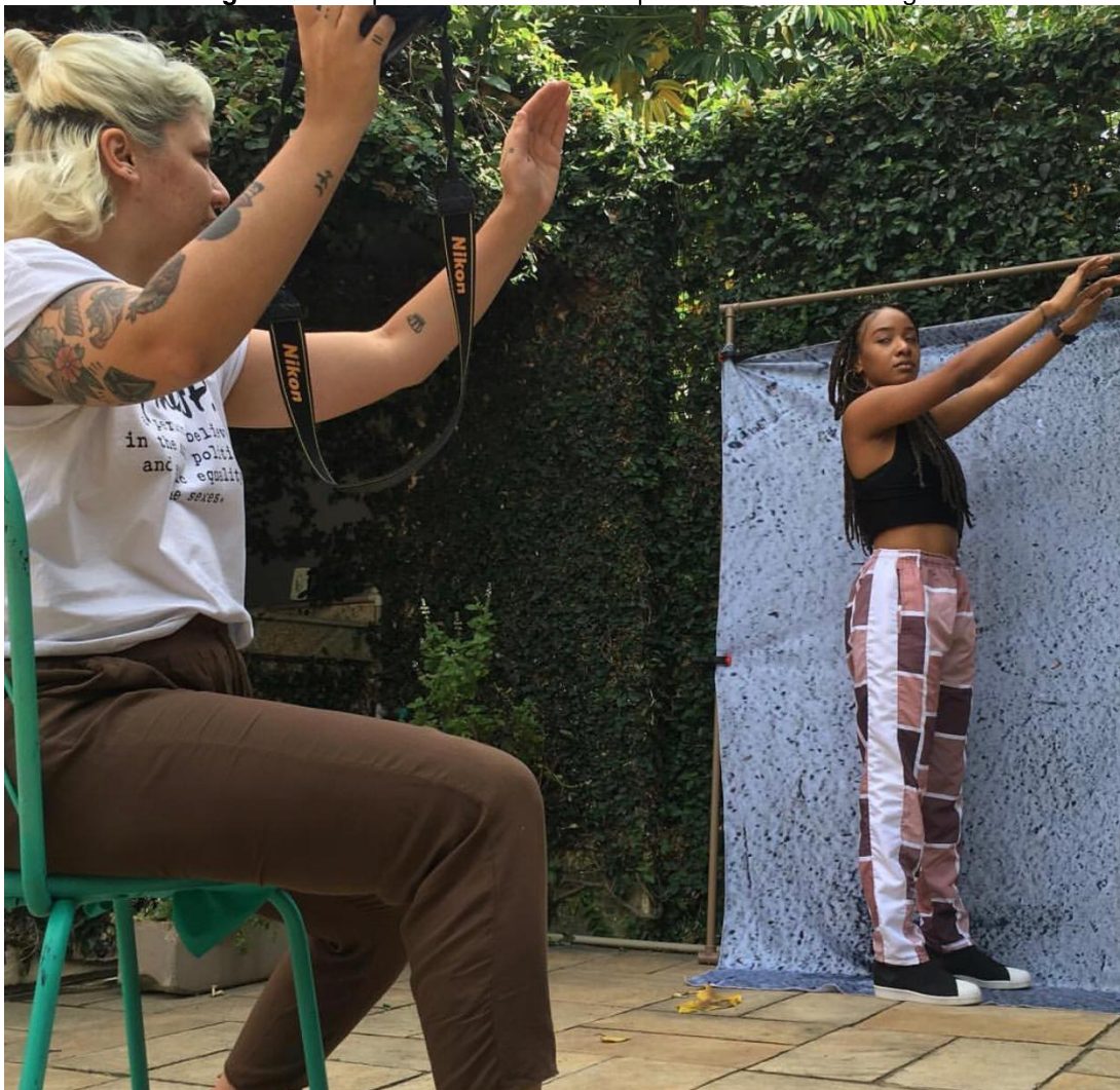
Figure 8: Independent fashion entrepreneur in a coworking.

personal or professional subjects have been observed to be fuels for new businesses ideas among independent entrepreneurs. Data shows that these interactions also incites independent entrepreneurs to help each other on their daily professional routines, creating a collaborative atmosphere as they provide support to each other. Figure 8, for example, shows an independent fashion entrepreneur making a photoshoot of her products in the external area of a coworking, having another coworker as a model - which was a very common scene to be seen.