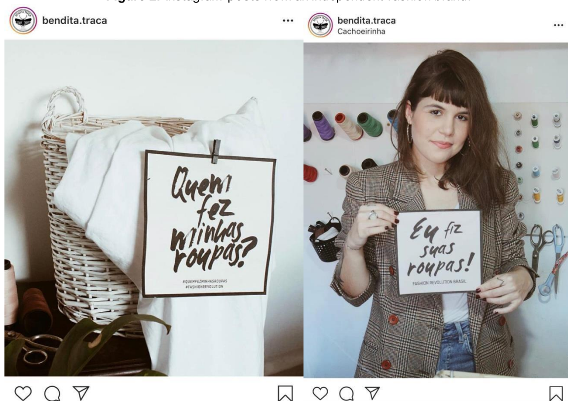
Figure 2: Instagram posts from an independent fashion brand.

Translation: "Who made my clothes?"; "I made your clothes".