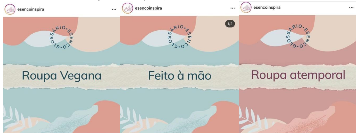
Figure 4 :Instagram posts of an informant's brand.

Translation: "Vegan clothes"; "handmade"; "atemporal clothes".