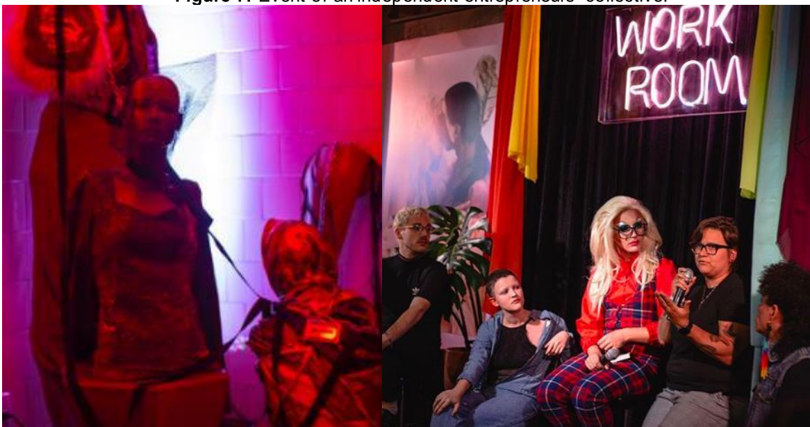
Figure 7: Event of an independent entrepreneurs collective.