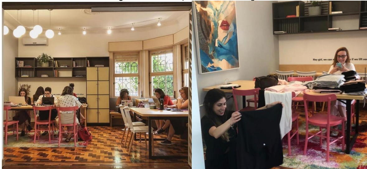
Figure 9: Shared space in a coworking.

Data suggests that one of the main factors that enable a collaborative atmosphere in this context is the physical proximity among these entrepreneurs, once they share spaces and meet each other frequently. But not only the physical proximity is what bonds them: common interests and shared values among these entrepreneurs were also observed to be important key points in their relations. Figure 9 shows a shared workspace in a women-only coworking in Porto Alegre, in which several freelancers and independent entrepreneurs work together, but each of them in their own business.